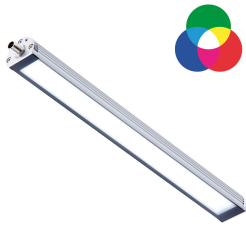
Darstellbares Farbspektrum / Displayable colour spectrum