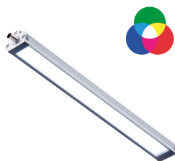
Darstellbares Farbspektrum / Displayable colour spectrum